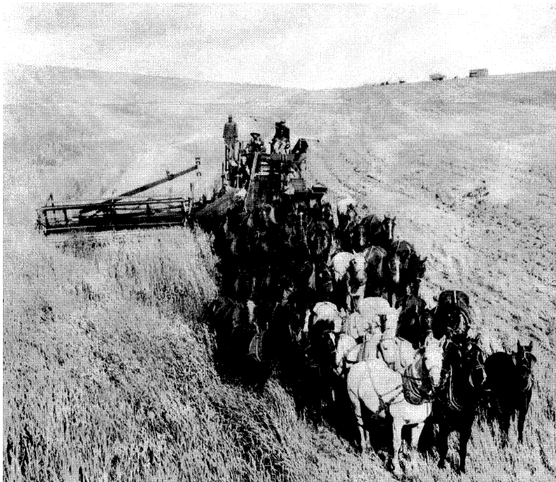
The Wheat Harvest, 1880

Our western brothers have accomplished one great good by their war upon the railroads. Some time ago they carried a law through the Illinois legislature, which provides for the limiting of freight rates by a board of officials appointed for this purpose. The railroads, of course, opposed this measure, and it was carried to the United States Supreme Court to test its constitutionality, resulting in a complete victory for the Patrons. Illinois is the only state in the country to have such laws.